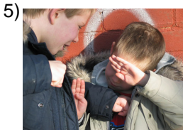
to bother, to bug