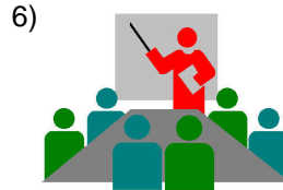
meeting, get together